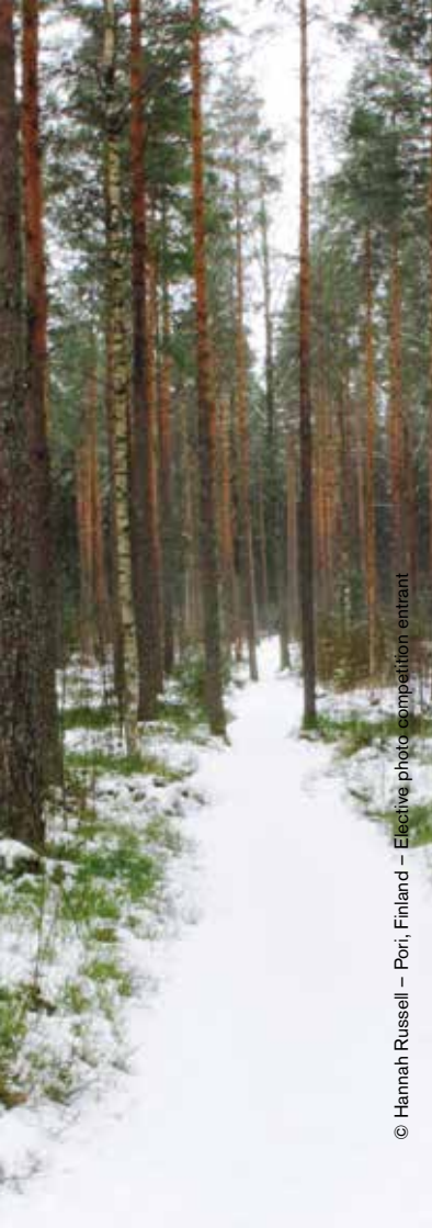
Pori, Finland – Elective photo competition entrant

fairly quickly after moving to the UK. You must get up-to-date advice concerning affected areas and current prevention and treatment. Ensure that you have sought advice about prophylaxis, that you take the tablets and that you take all precautions to avoid being bitten by mosquitoes. The NaTHNaC website provides options for different antimalarial tablets according to the countries visited.