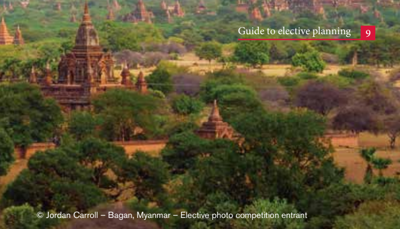
Bagan, Myanmar – Elective photo competition entrant

‘These last two months in Spain have given me new insight into Spanish history and culture. I may not have been to Africa, India, China or Australia but I am certain that my time in Spain was unique.’ Elective student, Spain