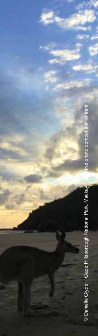
Cape Hillsborough National Park, Mackay – Best of elective photo competition entrant

Many of our members agree their elective was one of their most memorable experiences as a student. Completing your elective is an opportunity to widen your experience; not only of your profession, but also of other cultures should you decide to go overseas.